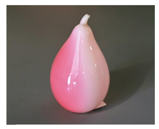
New England Peach Blow