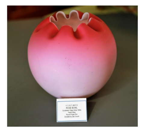
Gunderson Peach Blow