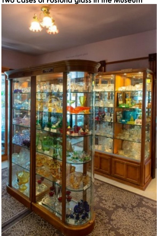
Display of milk glass items in the Museum

Two cases of Fostoria glass in the Museum