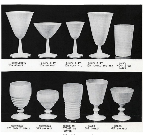
Bryce Milk Glass - 1957