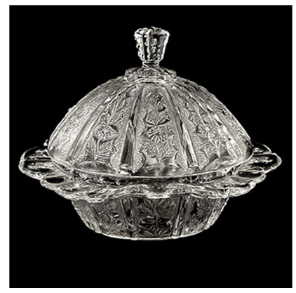
Paneled Daisy c.1890

In 1881, Bryce Brothers joined with 14 other companies to form the U.S. Glass Co. Bryce became Factory B. That lasted all of two years, when, in 1883 Bryce withdrew from U.S. Glass. The brothers purchased a closed plant in Hammondville, PA, and produced glass there under the Bryce Brothers name. Then, in 1896, they constructed and opened a new plant in Mt. Pleasant, PA, where they continued operations until the company was sold in 1965.