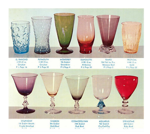
Bryce catalog page from 1950s