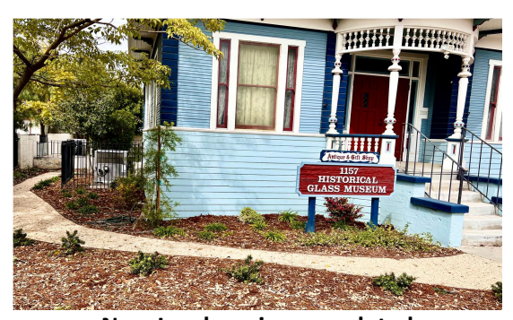
New Landscaping completed