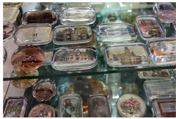
Shelf of Advertising Paperweights

We are always looking for assistance with the inventory project. If anyone is interested and available, please contact the inventory coordinator, Kathi Jablonsky at kj@jablonskyconsulting.com