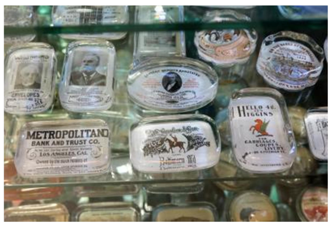
Shelf of Advertising Paperweights

While we have featured some individual egg-shaped paperweights, there are many other shapes and sizes on display, as seen in the two photos from the Museum.