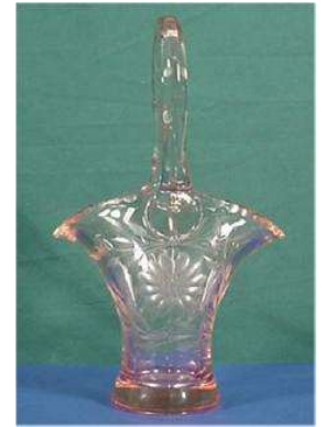
US Glass Co.