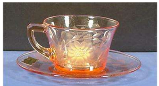
Cambridge Glass Co.