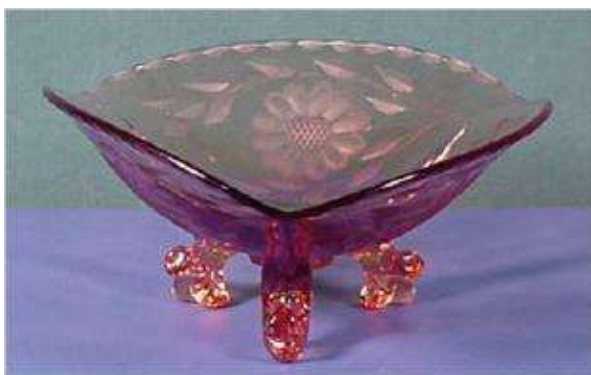
Central Glass Co.