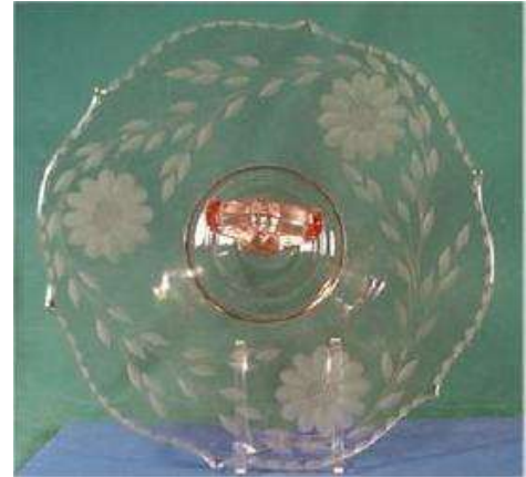
Lancaster Glass Co.