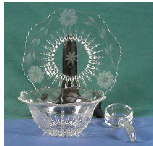
New Martinsville "Radiance"