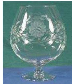
West Virginia Glass Specialty Co.

With the onset of WWII American glass became more difficult for the Hughes Corn Flower Company to import. Even after the war, in the mid-1940's, glass manufacturers in the States could not keep up with the rebound in domestic demand, let alone supply the Canadian market. The Hughes' were forced to look elsewhere and therefore turned to Europe to take up the slack for mouth-blown glassware. European glass was imported from Belgium, Czechoslovakia, Germany, Hungary, Rumania, and Sweden. Importing from Europe also was not without its challenges. Quality, quantity and timely delivery were all matters of concern for the Hughes Corn Flower Company.